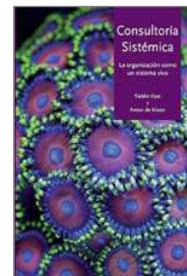
Systemic consulting. The organization as a living system